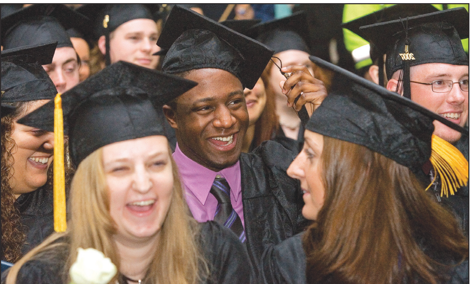
Commencement 2007: Presenting Lasell College's newest alumni.

All charities are free to set the rates they offer, as long as the rates comply with any applicable state regulations. Generally, charities choose to follow the schedule of recommended maximum rates published by the American Council on Gift Annuities. These recommended rates change from time to time, based on a variety of economic factors. (Any changes would affect only newly issued annuities.) The following chart shows the most recent rates recommended for annuitants of various representative ages.